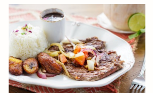
Original Cuban Steak

Served with white rice, beans and sweet Plantain | 17.5.....add two eggs ....$2.50