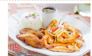
Salmon & Shrimp

Mixed Paella ..... Savory Seafood Yellow Rice Made With Shrimp, Chicken, Fish and Ham | 25.99