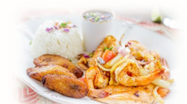
Salmon & Shrimp

Mixed Paella ..... Savory seafood yellow rice made with shrimp, chicken, fish and ham | 25.99