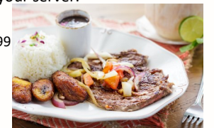
Original Cuban Steak

Served with white rice, beans and sweet Plantain | 17.99.....add two eggs ....$2.99